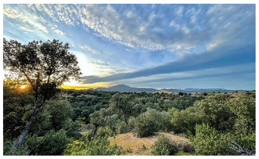
Paraje Los Mirabeles, finca La Ronca: the meadow of centenary holm oaks is the hunting area of the imperial eagle.

The initiatives taken by private landowners since the 1970s have been exemplary, as well as extraordinarily generous and fundamental for the recovery of this species. The local, regional and national legal framework has of course been a necessary basis, the Directives issued in Brussels are also necessary, the support of the Administrations most of the time moral - is also necessary, but the individual effort, combined with that of the private owners who have fought for the future of the Imperial eagle, has been, and this cannot be stressed enough, absolutely essential for the success of the species.